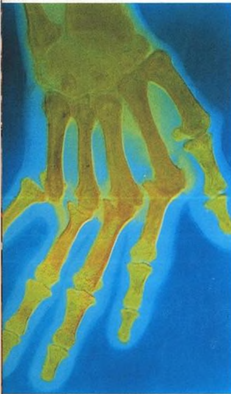
See page 30.