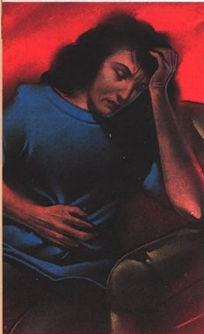
See page 114.