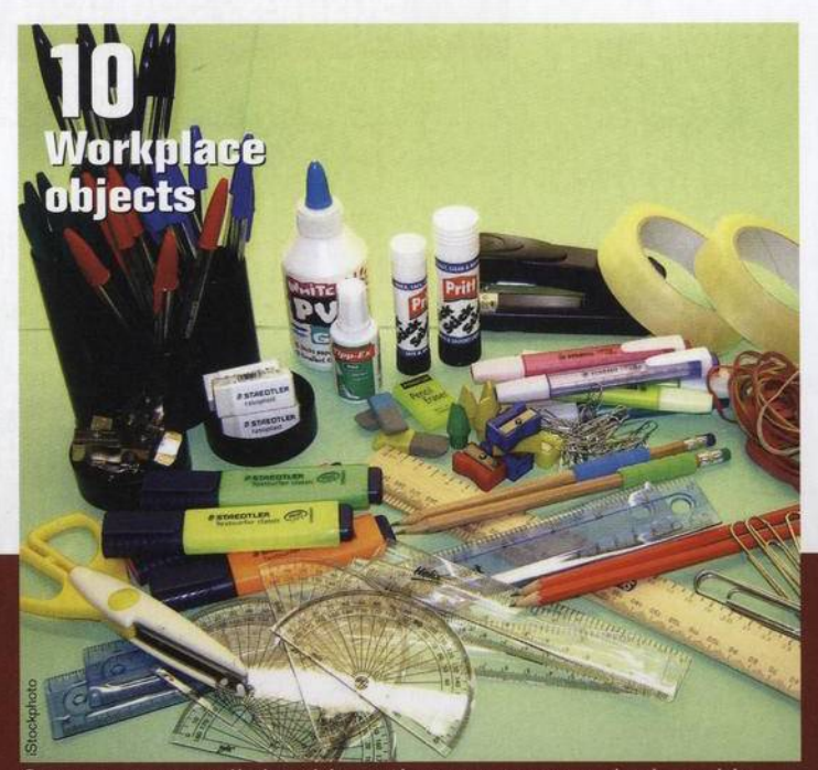
Can you name all the things that are on your desk and in your office? Find out with our special vocabulary test.