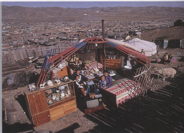
A Mongolian family with their house and possessions (p. 510)