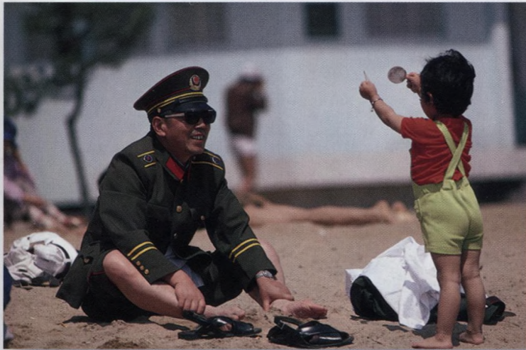
A Chinese father and son at leisure (p. 475)