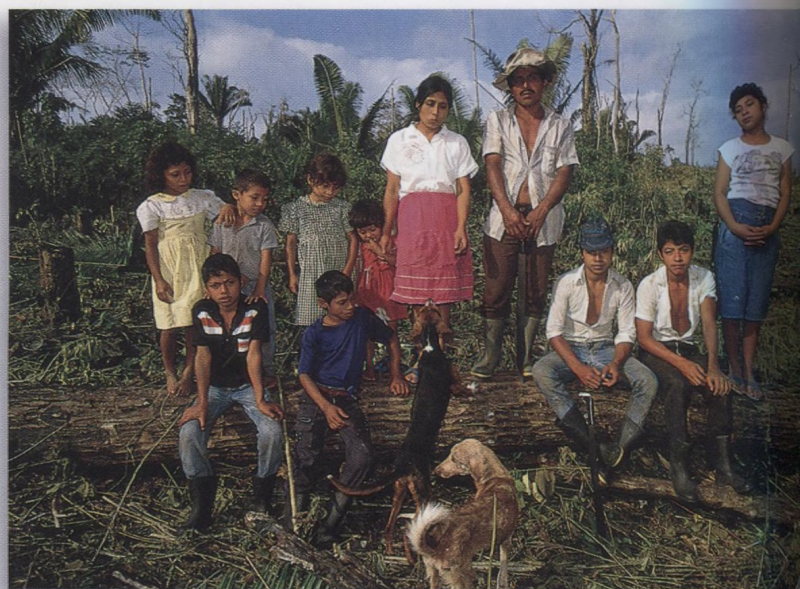
A Guatemalan family takes a break from fieldwork (p. 146)