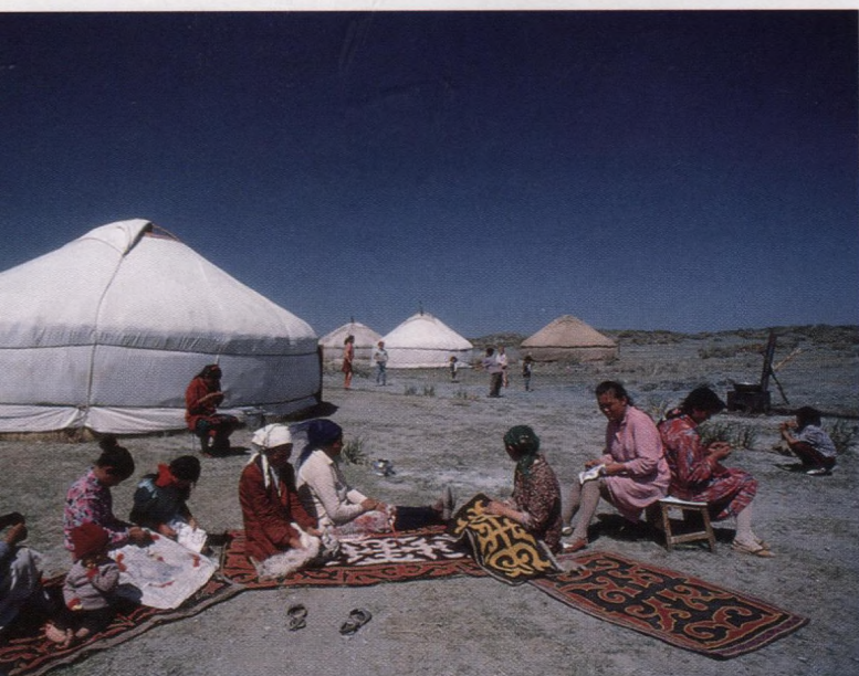
Members of a Kazakh family do some needlework (p. 284)

Civil War in Tajikistan 284 The Free Market in Central Asia 284