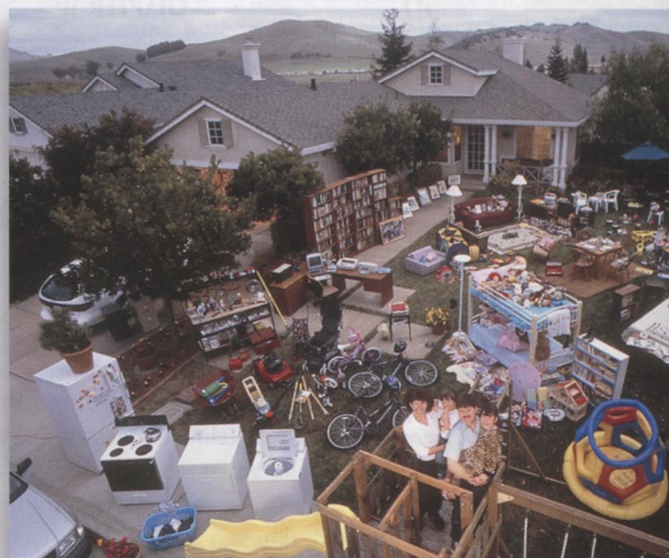
A family and their possessions in the United States (p. 15)