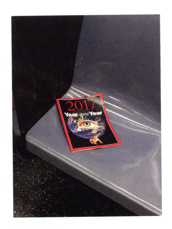
The Year Ahead Table of Contents