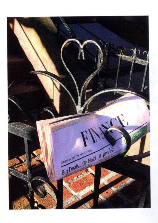
Finance p44 The next crisis; a merger scorecard; unhappy hedge funds; Brexit and

banks; reinsurance; a Chinese bubble; TIAA's Ferguson; what's 17-Across?