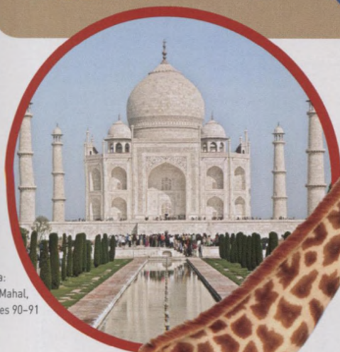
Asia: Taj Mahal, pages 90-91