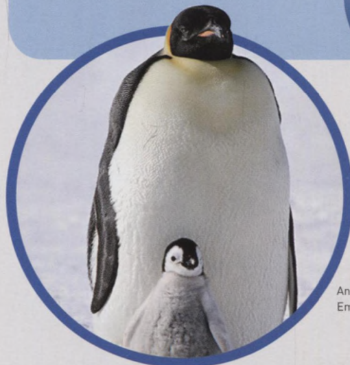
Antarctica: Emperor penguins, page 125